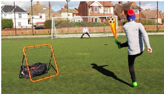
c. Volley Challenge