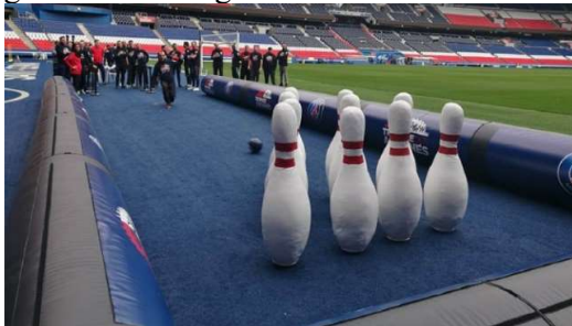
g. Foot- Bowling