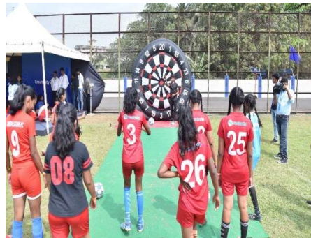
f. Inflatable Football dart Game