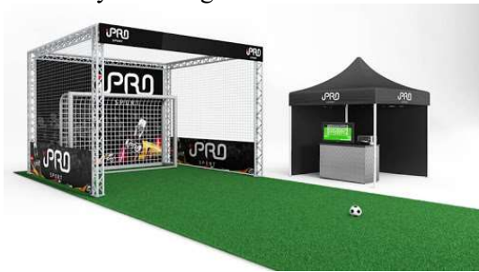
e. Penalty Challenge