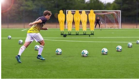
a. Freekick challenge