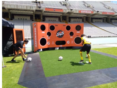
d. Accuracy Challenge