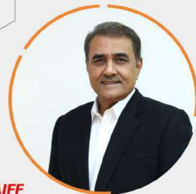
Mr. Praful Patel, President, AIFF

As coaching is an ever evolving concept, All India Football Federation has introduced the revalidation process for its licensed coaches which will enable all to sync with new theories to take Indian Football forward together.