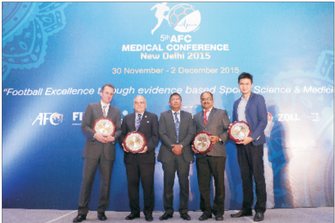
The 5th AFC Medical Conference in New Delhi was dubbed as the 'best ever.'