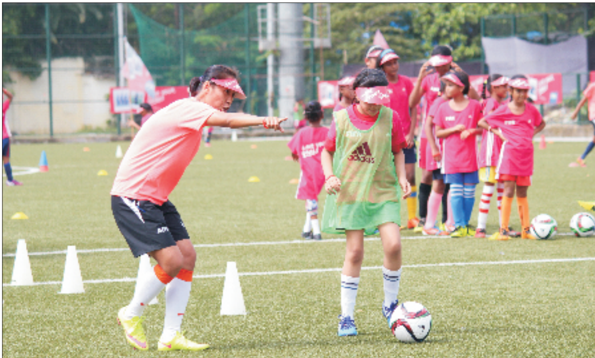
Indian Captain Bala Devi explains the basics to a young girl in the FIFA Live Your Goals Campaign in Mumbai.