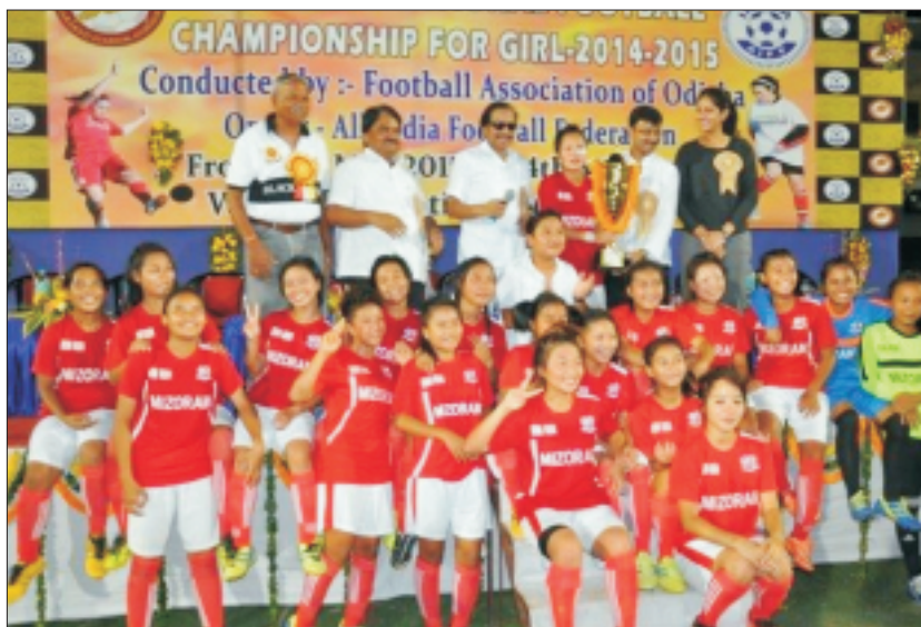
Mizoram – Champions of Sub-Junior Girls NFC 2014-15 held in Cuttack, Odisha

VENUE : CUTTACK, ORISSA DATE: 8th TO 24th MAY 2015