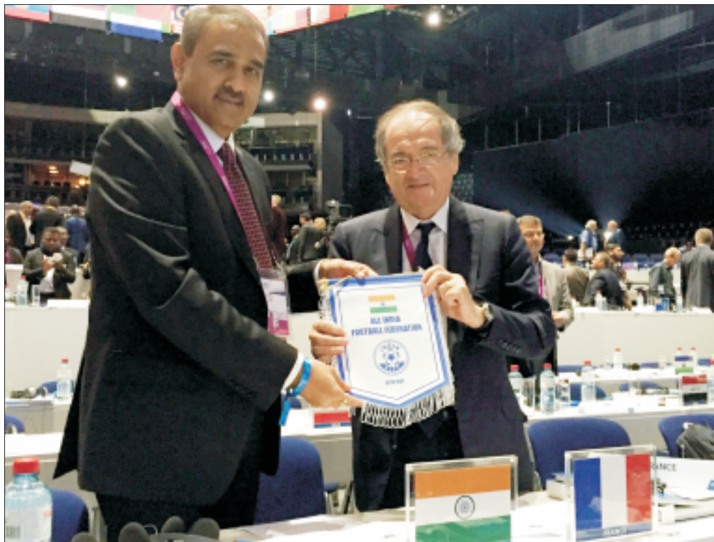
AIFF President Mr. Praful Patel signed a MOU with the French Football Federation.