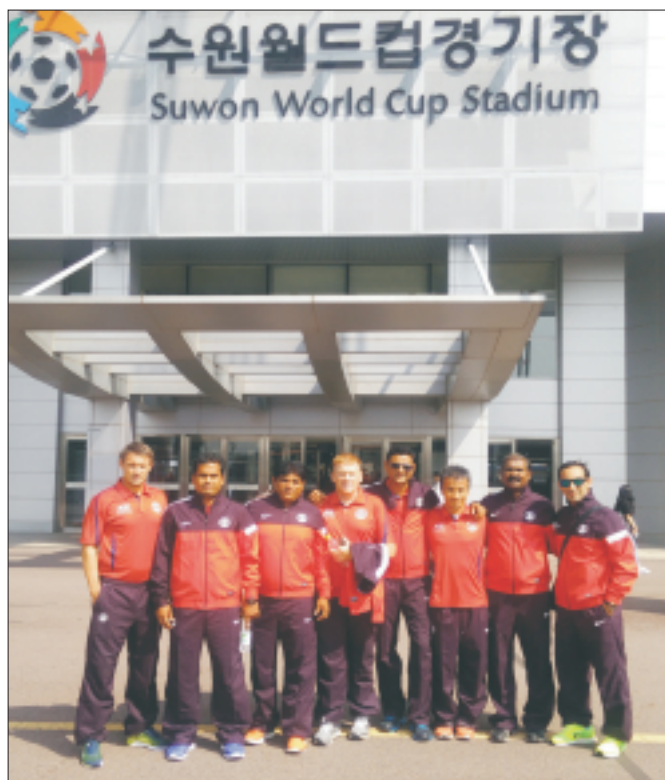
Participants at the Suwon World Cup Stadium, home of Suwon Samsung Bluewings

AIFF completed the second module of the AFC Pro Diploma Course at Paju, South Korea. The module concluded with the practical assessments and the presentations by the participants under the instructorship of Vincent Subramaniam. The module was held from 5th till 25th September 2015 and included match observations, club visits with theoretical and practical sessions.