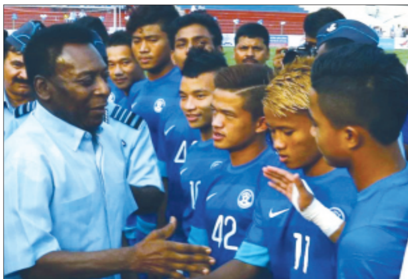
Brazilian Legend Pele with the AIFF Academy players during the Subroto Cup Final in New Delhi.