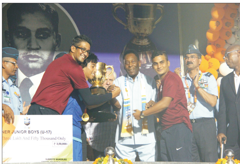
King Pele hands over the Subroto Cup to AIFF Academy in New Delhi.