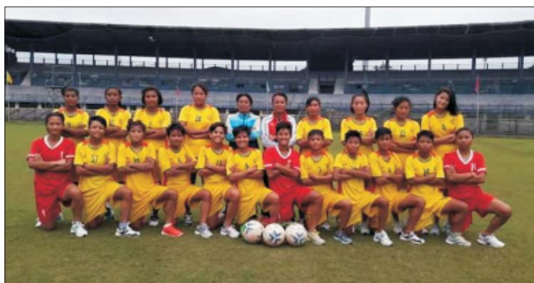
The triumphant Manipur squad

After the grueling semi-finals, Manipur & Haryana made it to the title clash and Manipur clinched the silverware eventually.