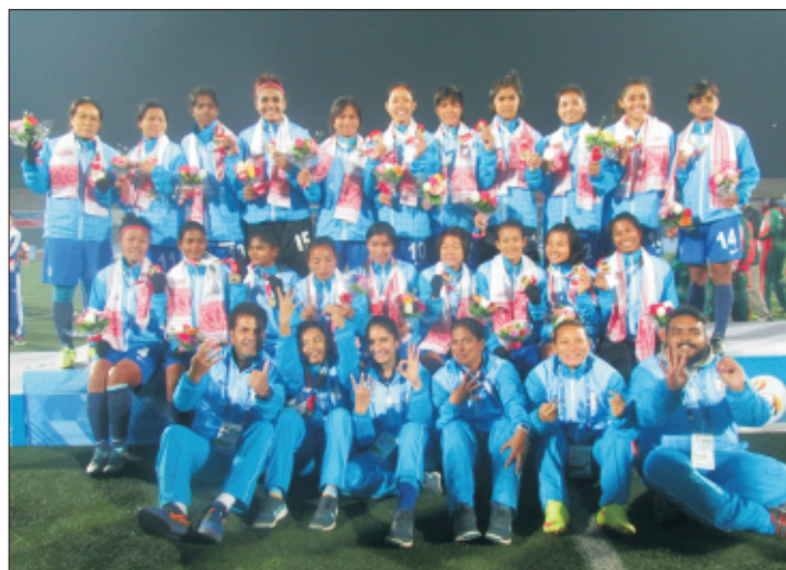
The Triumphant Indian Women's team after winning the Gold Medal in the South Asian Games in Shillong

Senior Women National Football Team participated in football competition of 12th South Asian Games 2016 which was held at Shillong from 5th February to 15th February 2016. Team brought laurels to the Country by winning the Gold Medal after defeating Nepal in the Finals.