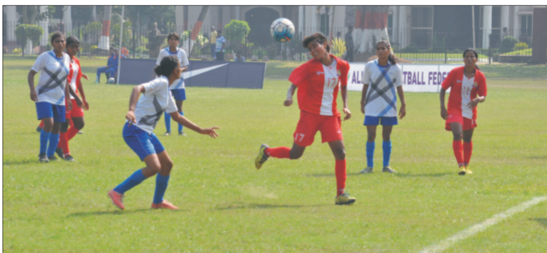
A tense moment in the Indian Women's League

The first match kicked off on 17th October and final was played on 26th October, 2016 at Police Ground.