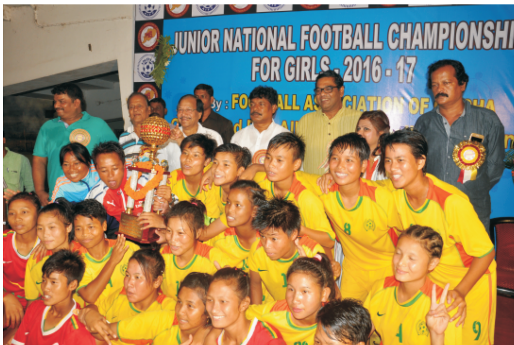
Manipuri girls pose for a photo session with the trophy

Junior National Football Championship was held at Barabati Stadium, Cuttack in Odisha from July 8 to 17, 2016