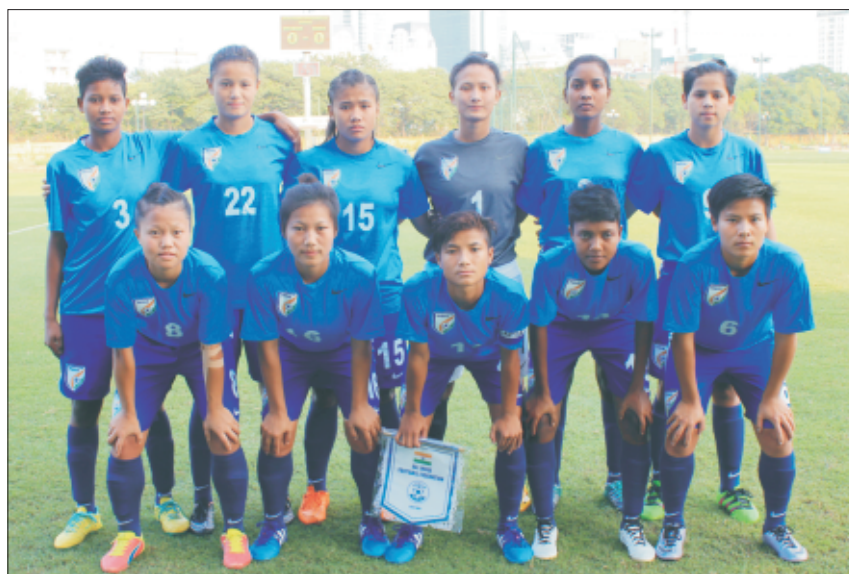
The Indian U-19 Women's Team pose for a Team picture prior to their match against Iran in Hanoi.

AFC U-19 WOMEN'S CHAMPIONSHIP 2017, QUALIFIERS 2016, HELD AT HA NOI, VIETNAM FROM 02ND TO 06TH NOVEMBER, 2016: