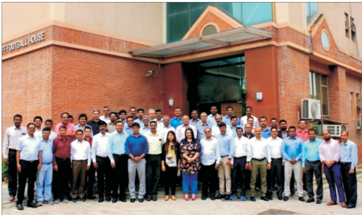
Participants of AIFF Match Commissioner's Workshop held in August 2016

The two-day Match Commissioners Seminar was held at the AIFF Headquarters in New Delhi on August 09 to 10, 2016. 52 participants - both existing (14 MCs) and new (38 participants) attended the seminar. The Seminar, which was conducted by AIFF, aimed at honing the knowledge of the participants on foolproof match operations. Apart from the sessions akin to Match Organisation & activities, Integrity, CMS and Media Matters were also conducted.