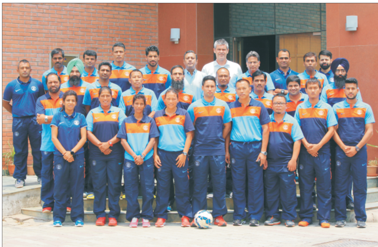
Participant of Advanced GR course held at the AIFF HQ in New Delhi