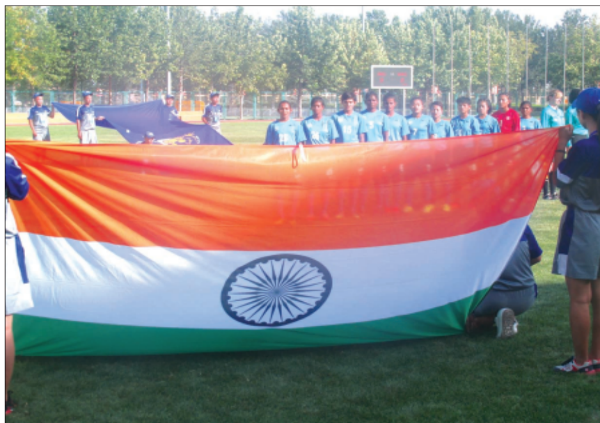
Indian team lineup before their match in the AFC U-16 Women's Championship in Weifang

AFC U-16 WOMEN'S CHAMPIONSHIP 2017, QUALIFIERS 2016, HELD AT WEIFANG, CHINA FROM 28TH AUGUST TO 05TH SEPTEMBER, 2016: