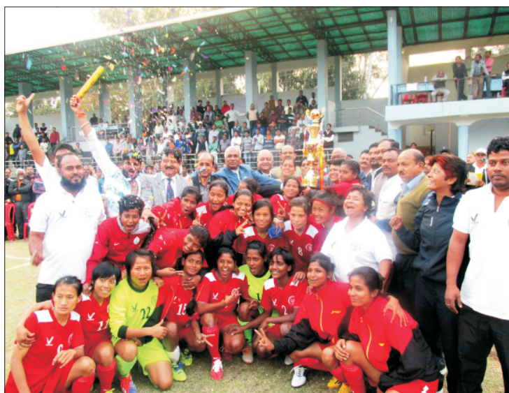
Railways team with the Winner's Trophy

Senior Women's NFC 2016 was conducted in Zonal format followed by Final round in which 10 teams participated.